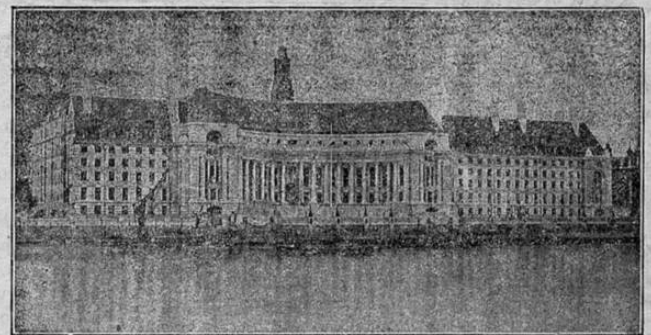
GOVERNMENT OFFICES LONDON

Whether you have sand and rock available, or not, you will find it much more economical and certainly very much more satisfactory, to employ Ready Made Concrete Units.